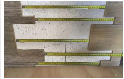
3. Measure each section in the gap.