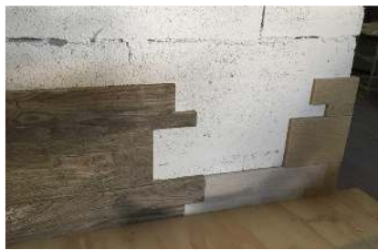
7. Working from the bottom to the top, right to left install the next row of panels until the gap between the corner pieces and the full panels is less than a full panel.