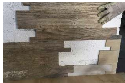
8. By alternating the installation on your wall, starting one row on the left and the next row on the right, the installer ensures that the rows are always slightly offset, thus providing seamless final installation.

For additional information contact us at www.realstone.com | 1.866.698.5066