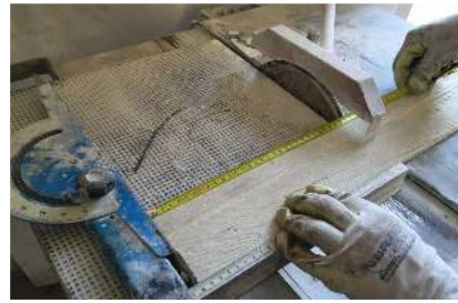
5. Cut down the individual pieces from step 4 to fit the gaps you measured in step 3.