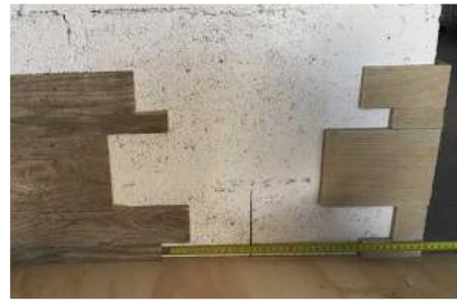
2. Work from left to right by installing Antique Wood panels until the gap between the corner pieces and full panels is less than a full panel.