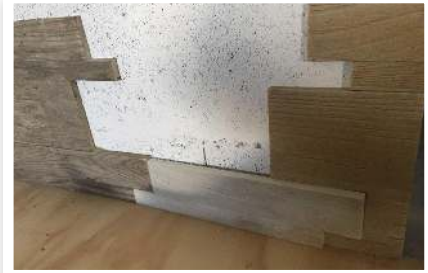
6. Install the individually cut pieces into the gap.