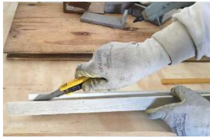
4. Use a sharp industrial knife to cut the mesh at the back of each panel so you end up with individual loose pieces.